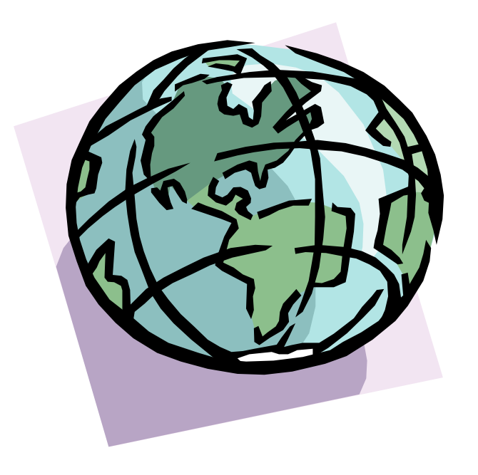
National University of Singapore